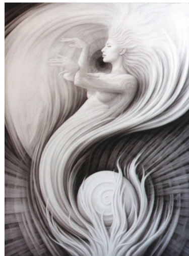
Illustration in Children's Books by Art Style