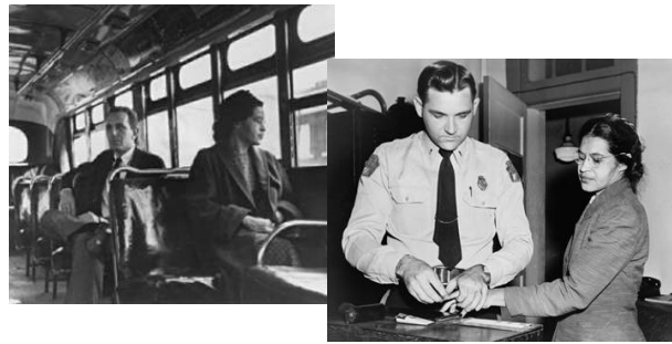
Rosa Parks (1913-2005)

A Picture Book of Rosa Parks (J92 Parks)