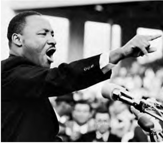
Martin Luther King, Jr. (1929-1968)

Happy Birthday, Martin Luther King (J92 King)