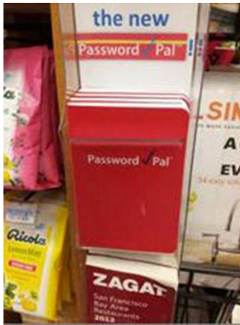
Figure 1. The password Pal: A blank book speaks volumes

Much to my surprise, writing down passwords on paper is an uncontroversial solution that is endorsed by a Windows security expert. 68