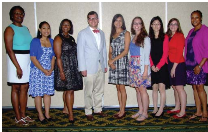
Student award winners were acknowledged at a special ceremony at the Society of American Archivists annual meeting in New Orleans, LA