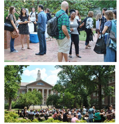
Top photo, breakfast in the sculpture garden. Above and left, lunch in front of Manning Hall.